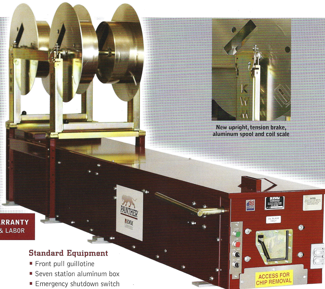
New upright, tension brake, aluminum spool and coil scale